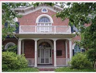
Thomas Conner House